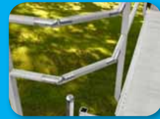
Handrail corner kit