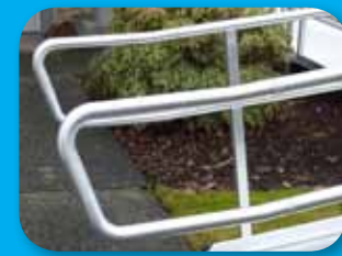
Handrail end loops