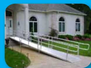
Completed 28' system