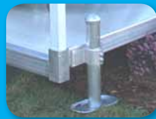
Support legs are individually adjustable for height