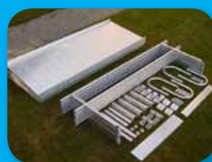
Components for 24' system