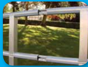
Simple handrail connection